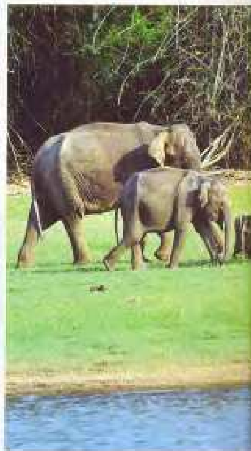
Clockwise from below left: See elephants at Nagarhole National Park; Kabini Orange Country Resort lies by the Kabini River; take a boat safari on the river; see spotted deer at Nagarhole; try tribal-style food here

From the cottages, a stroll to the dining area which has a panoramic view of the Kabini River with the forested hills of Nagarhole National