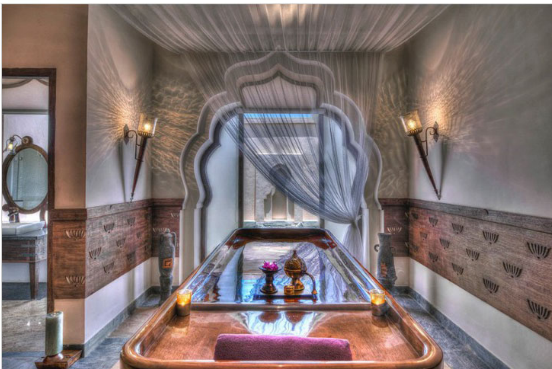
The property's on-site spa takes its inspiration from the Lotus Mahal.