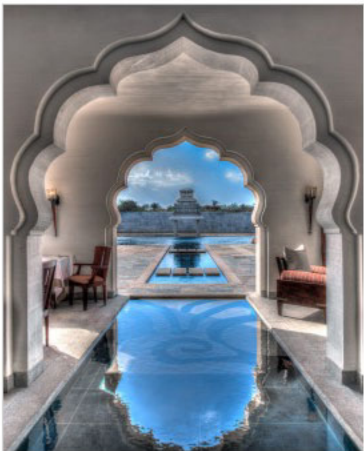
Orange County, Hampi re-creates the grandeur of the Vijayanagara Empire.

Long the preserve of hippies and backpackers, Hampi now has a palatial hotel that is bringing a dash of sophistication to this scrubby region of Karnataka. The architecture evokes the 15 th -century temple and palace remains several kilometers away, traces of lost glory that pepper the lush expanses between hillsides dotted with giant granite boulders. Like miniature mountains in a Zen garden, three such boulders emerge from the hotel pool backed by a recreated temple tank. Try the four-hand massage at the on-site spa, a structure inspired by the Lotus Mahal in Hampi's royal heart. Pool villas here are suitably palatial, boasting an in-room Jacuzzi and oversized beds with flowing crimson canopies. Not that you would spend most of your time indoors; there's good reason why Wi-Fi coverage doesn't reach the guest quarters. It's far better to trail the in-house experts across the long-lost Vijayanagar capital, where kings had 16,000 consorts, rose-and-perfume-dispensing pools for their queens, and palaces for their pet elephants. In Hampi, the exuberantly carved walls tell tales and even sing, as the fluted musical pillars at Vittala Temple can attest. But don't leave your doors unlocked or you'll discover the local monkeys' penchant for stealing iPhones and homemade in-villa sweets. (91-8394/297-700; orangecounty.in ; doubles from US$555).