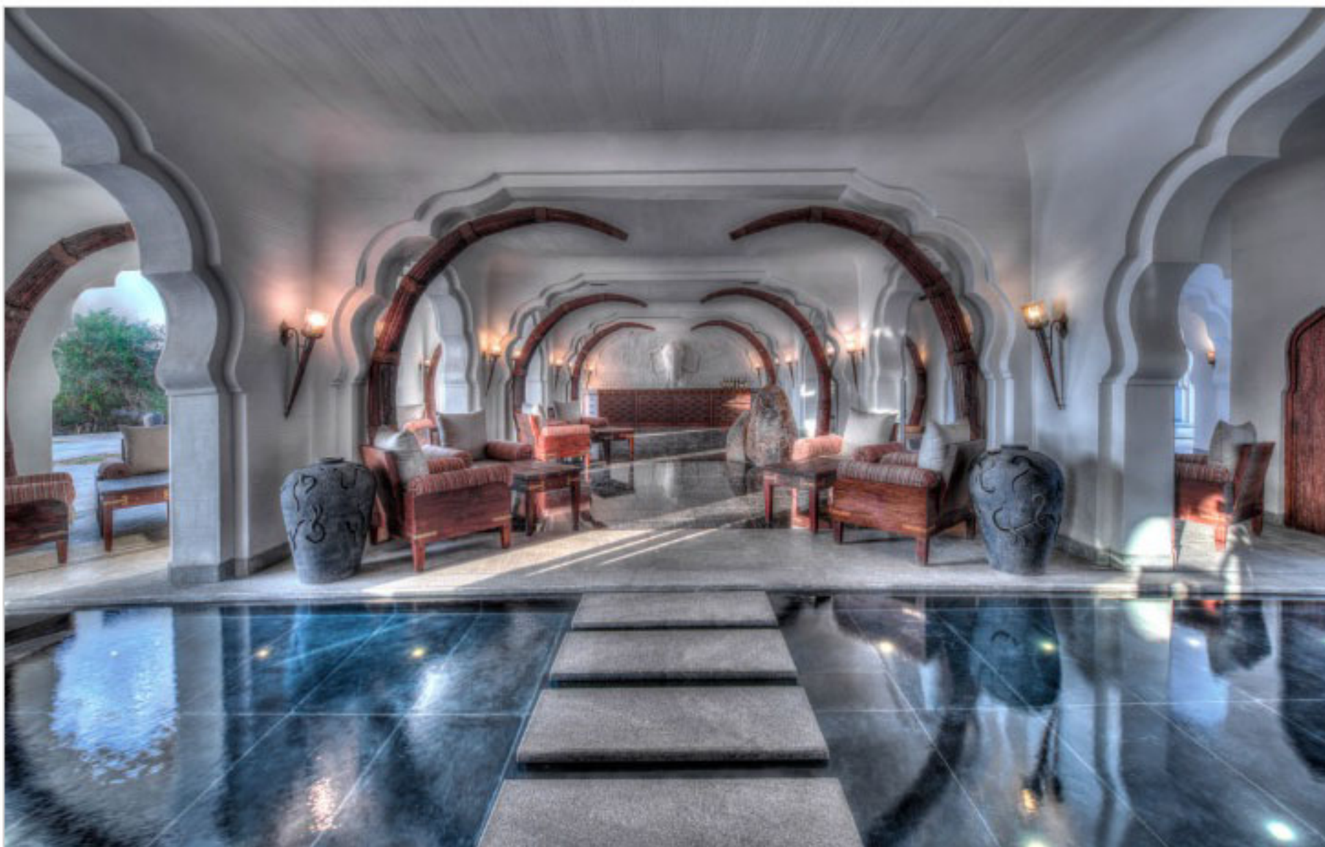
The lounge area at Orange County, Hampi.